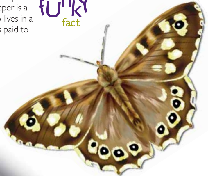
Speckled wood butterfly