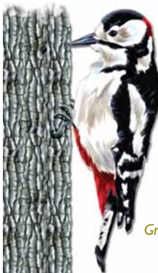
Great spotted woodpecker

Coldfall Wood supports two types of woodpecker: the great spotted and green woodpecker. Listen out for the loud drumming of the great spotted woodpecker between January and June and the distinctive laughing 'yaffle' calls of the green woodpecker.