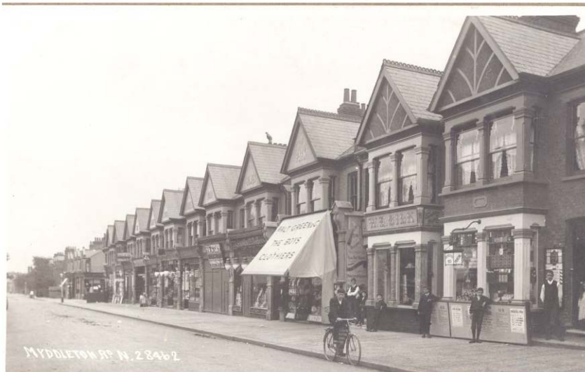
Figure 2: Terrace on south-side of Myddleton Road, circa. 1902

semi-private enclosed garden as can be seen in Fig. 1. Rooms at street level on the ground floor were occupied with basic shop units and converted to shopfront by the early 20 th century on the south-side of the street, nos. 69-109. The original front fenced gardens disappeared allowing the street to assume a more commercial appearance.