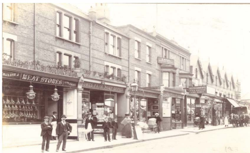
Figure 3: Terrace on south-side of Myddleton Road, circa. 1903

2.1.6 By the beginning of the twentieth century, the fabric of the street had altered significantly with a number of purpose-built shopfronts extending out onto the street, evident in the rest of the street. Over time, the development of retail in Myddleton Road has created the commercial characteristics of the local shopping centre that exists today. The extension of the electric tramline through to Bowes Park had encouraged further growth in the area and by 1912 there were 80 shops in existence.