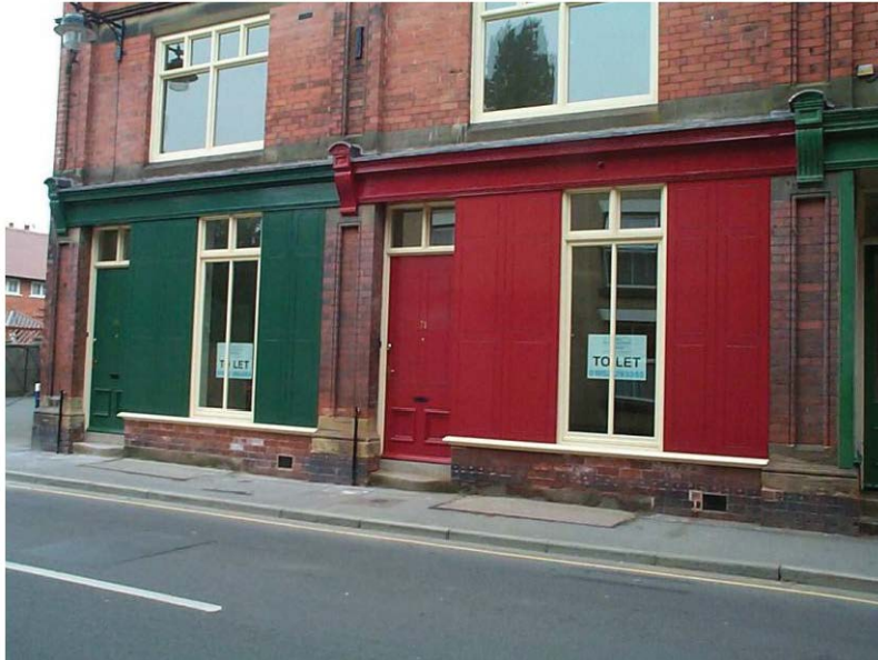
Figure 11: A shopfront converted to residential – solid panels that look like traditional external shopfront shutters, Wem, Herefordshire