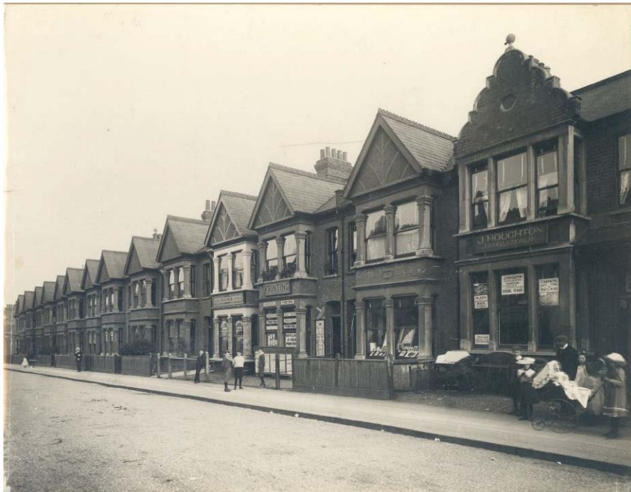
Figure 1: Terrace on south-side of Myddleton Road, circa. 1899