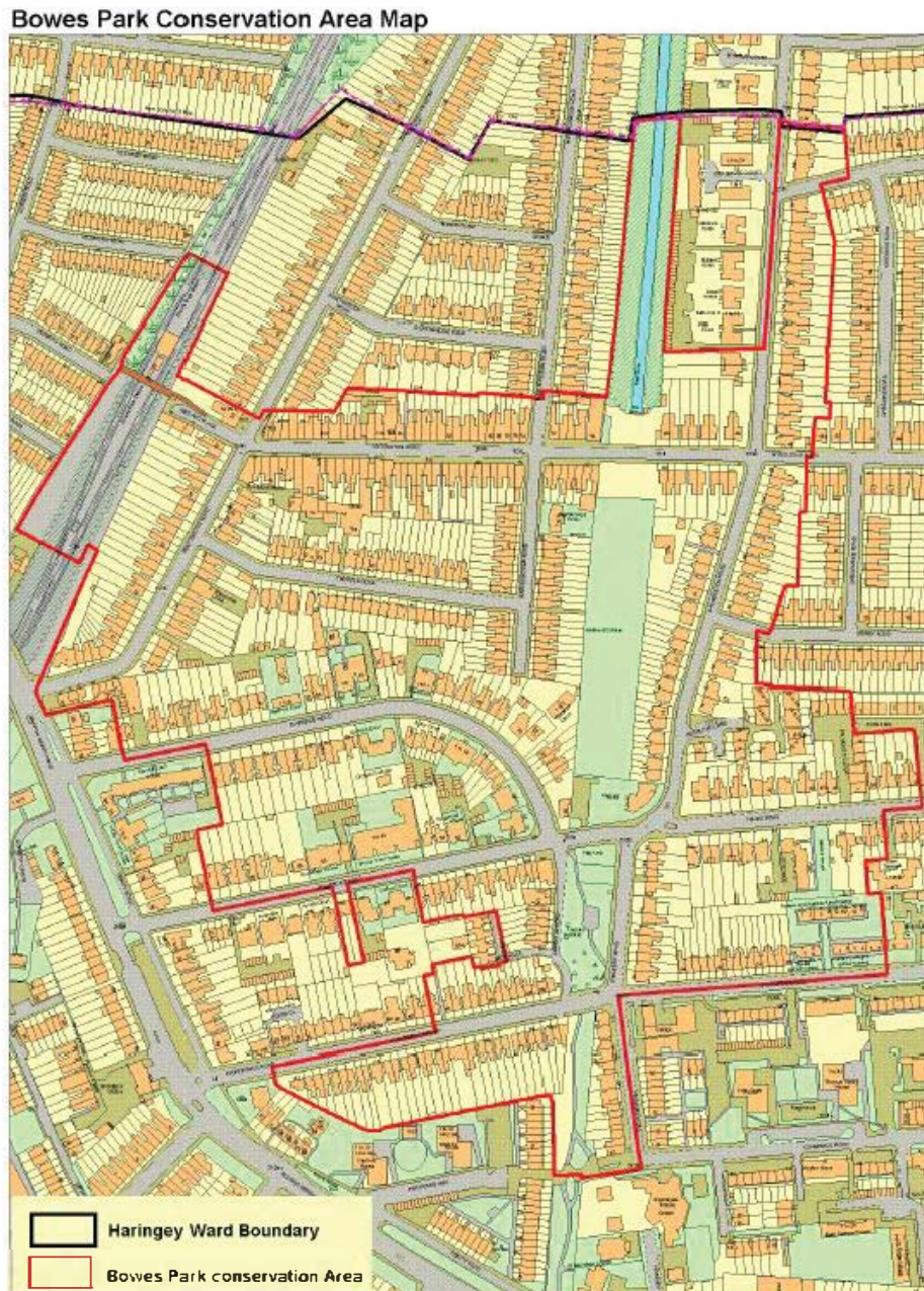
Figure 6: Map of Bowes Park Conservation Area

3.1.8 Myddleton Road is situated within the Conservation Area of Bowes Park (designated 29 th November 1994). Figure 6 provides a map of the designated Conservation Area.