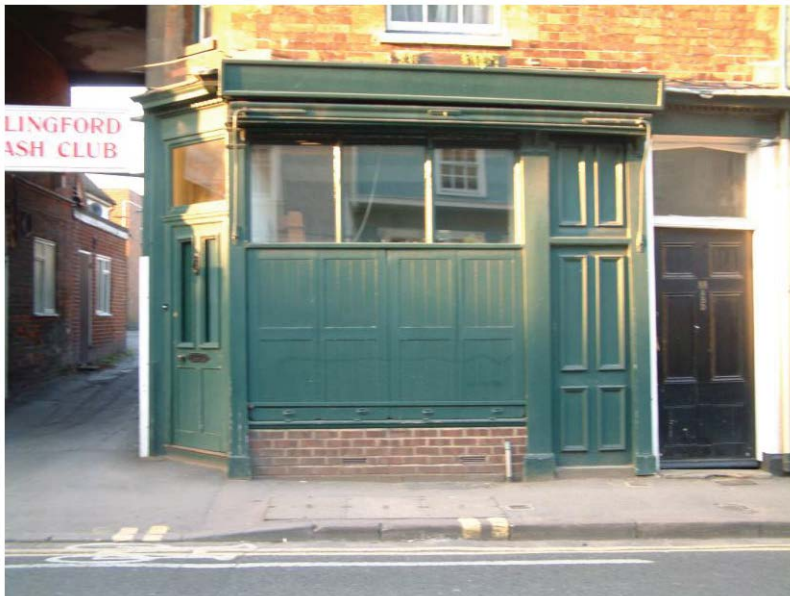
Figure 10: Traditional shutters, Wallingford, Oxfordshire