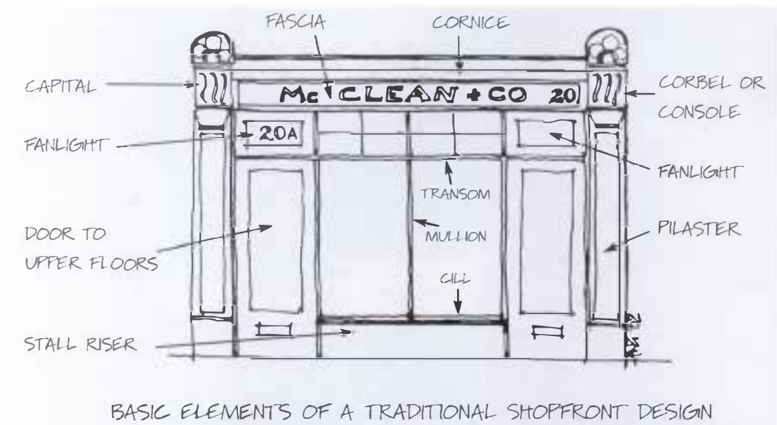
Figure 7: Basic elements of a traditional shopfront

A doorway, which may be either centre or side positioned and will often be recessed. If there is a separate door to the upper floors this should be maintained.