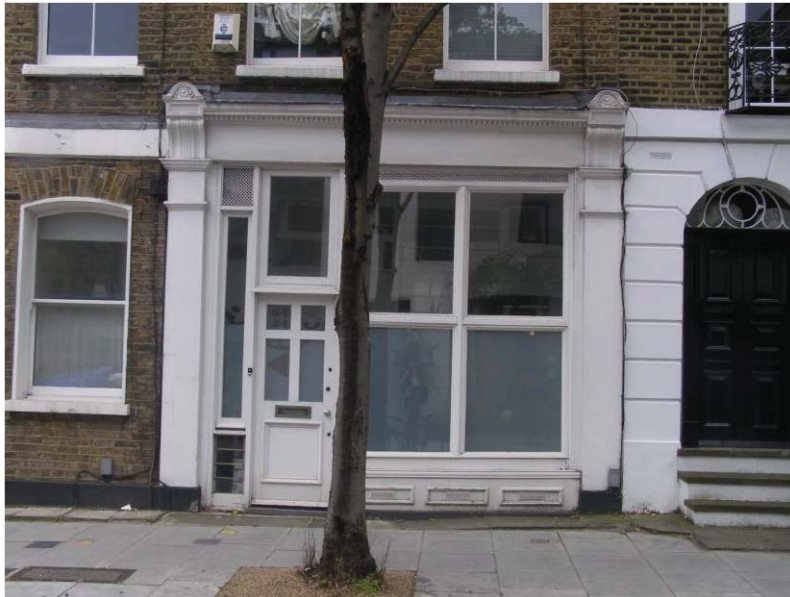
Figure 9: Wintergarden behind retained shopfront – a shop converted to residential, with wintergarden and obscured glass, Islington