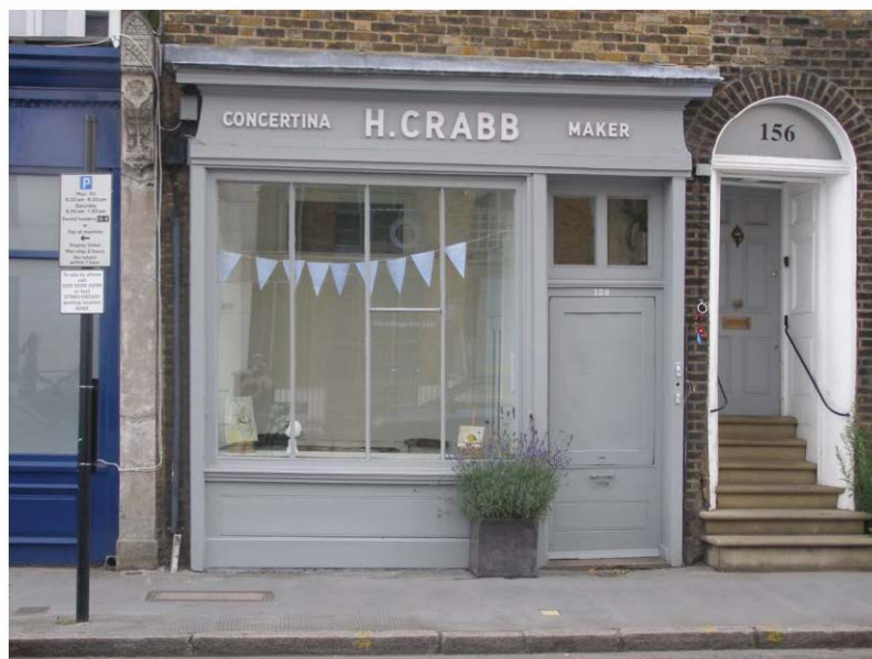
Figure 8: Zone Behind Shop Window – a Place for Art. A shop converted to residential, with a small space for art, Islington