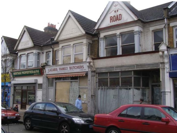
Figure 4: 91-95 Myddleton Road today, south-side