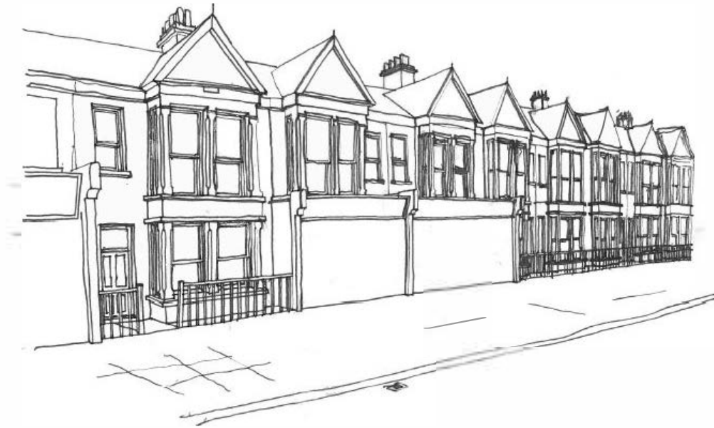
Figure 12: Terrace in transition from added on retail to return to residential

5.2.22 Fig. 12 below demonstrates the design tension of some properties converted to residential, with some plots still having shop units.