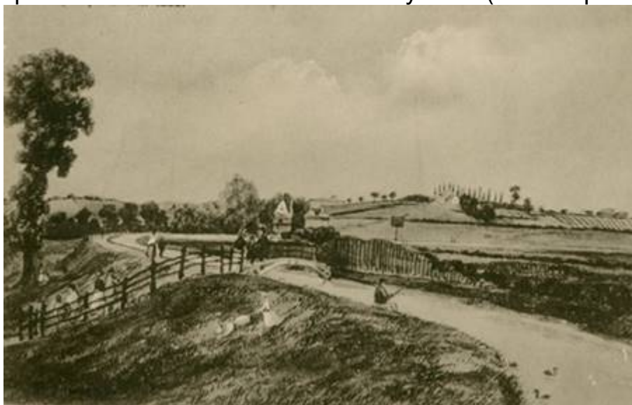
After the park was opened in 1869, people fished in the fishing lake and also by the New River.

Walking and fishing on rivers and waterways is a common theme in our picture collection at Bruce Castle. This image (below) shows people walking along the path by the New River whilst a gentleman fishes on the bank in 1832. This view is taken at the top of what was to become Finsbury Park (which opened in 1869).