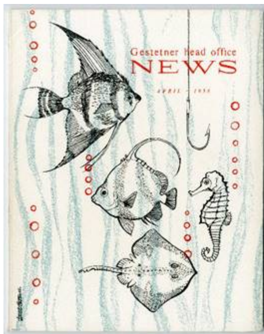
Gestetner Head Office News publication, April 1958

Anglers' Society and the Gestetner Angling Club when he was older (he worked for Gestetner's).