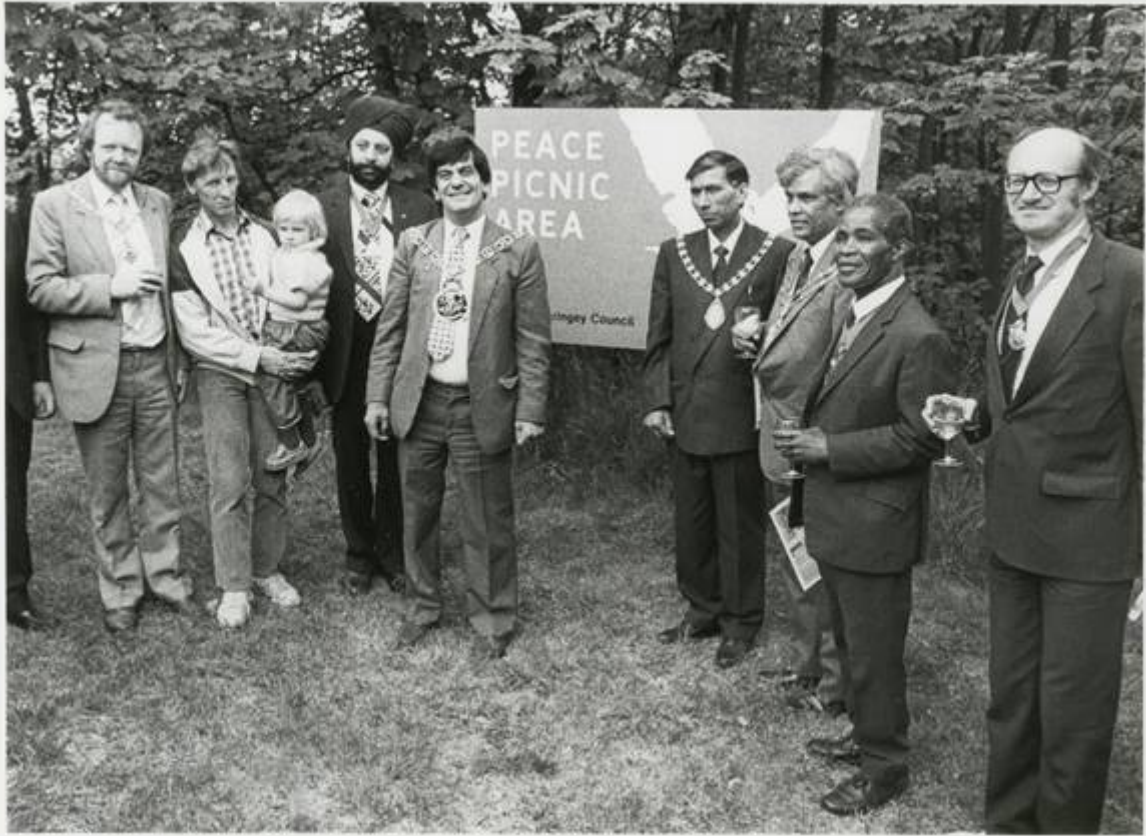
From the collections Bruce Castle Museum (Haringey Archive and Museum Service)