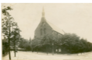
Interior of Holy Trinity Church, 1937

Early in the morning of Sunday 16 July 1944 a V-1 'Flying Bomb' fell on Granville Road, killing 15 people and seriously injuring 35 others. Twelve houses were destroyed; 100 others were damaged; Holy Trinity church, which stood just to the east of this notice, was badly damaged.