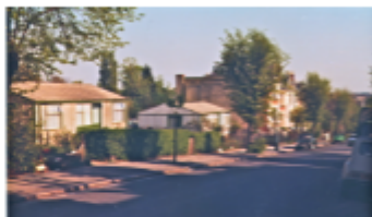
Granville Road prefabs, April 1947

In 1946 nineteen Arcon Mark V 'prefab' factory-built bungalows were erected on the Granville Road bombsite. Clad with corrugated asbestos cement, each was pre-wired, came with ducted air heating and had two bedrooms and a fitted kitchen including a refrigerator. They had a modern and compact look. Designed to last for 10 years, they actually stood until 1980. Local people remember prize-winning front gardens including one with a fishpond.