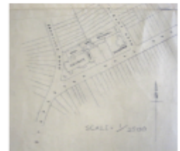
The plan of old church (Courtesy City of London, London Metropolitan Archives and Holy Trinity Church)

Holy Trinity Church (architect EB Ferrey) was consecrated in 1881 when the area was developed as a north London suburb, and took its place amongst other similar parishes in the rapidly growing city with its own loyal and active worshippers. In 1913 a church hall (architect J S Alder) was added.