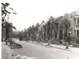
Granville Road July 1944

Early in the morning of Sunday 16 July 1944 a V-1 'Flying Bomb' fell on Granville Road, killing 15 people and seriously injuring 35 others. Twelve houses were destroyed; 100 others were damaged; Holy Trinity church, which stood just to the east of this notice, was badly damaged.