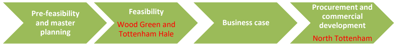
Figure 2: The stages of District Energy Networks in Haringey.

Road West, Tottenham Hotspurs and Northumberland Park. This will be a special purpose vehicle (SPV) owned by the Council which will provide these sites space heating and hot water loads from a single energy centre. The energy centre will be located on the High Road West site.