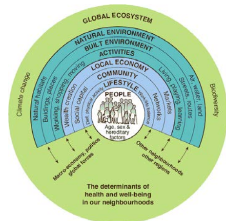
Determinants of health and wellbeing in our neighbourhoods, from Barton & Grant (2006)

With regards to HIA , the NPPF requires planners to promote healthy communities and use evidence to assess health and wellbeing needs; and additionally, the GLA and the Mayor are required to ‘have regard to health’ in preparing strategies at the London-scale. It is important to understand that HIA is to a large extent about giving consideration to the wider determinants of health , including those related to the quality of the natural and built environment, people’s daily activities and lifestyles, and local communities and the economy.