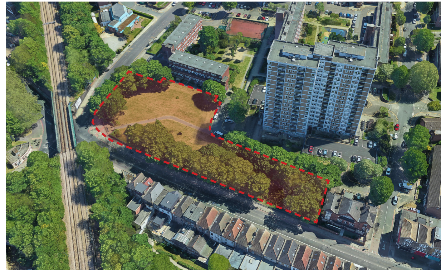
Area of the proposed new homes near the Sir Frederick Messer Estate