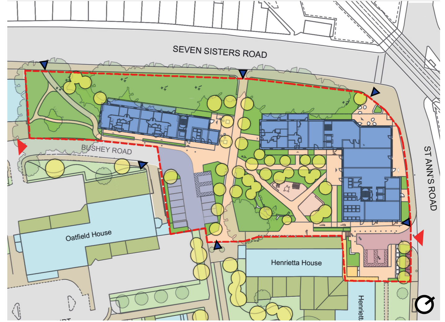
Proposed site plan (indicative)