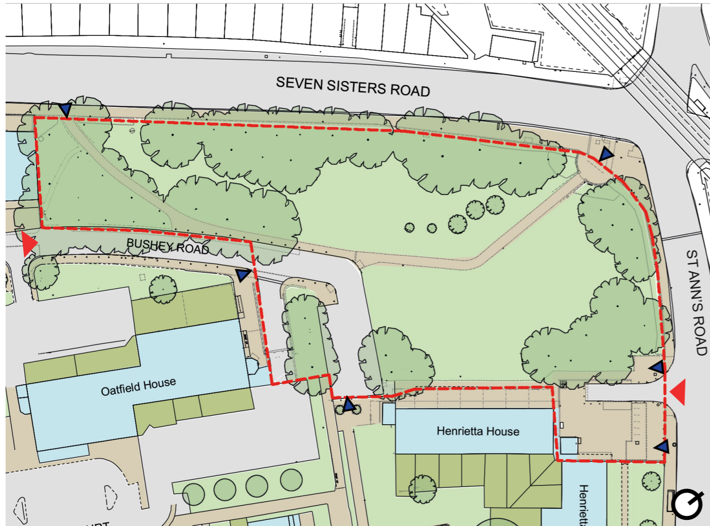
Existing site plan